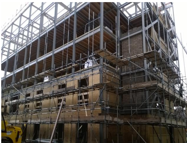
External Envelope Block B