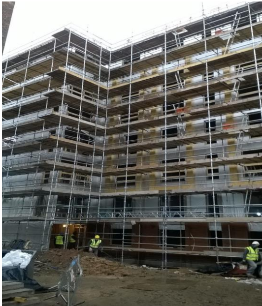
External Envelope Block E