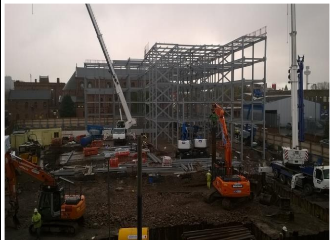
Frame to block D