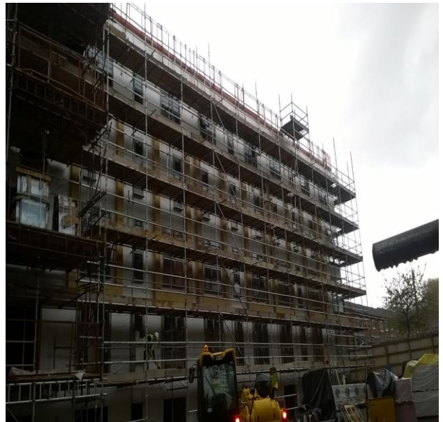
External Envelope Block C