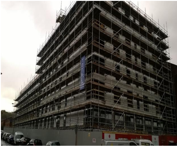
External envelope Block E and C