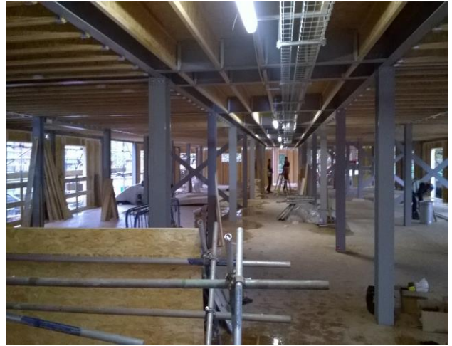
Internal upper floors of Block B