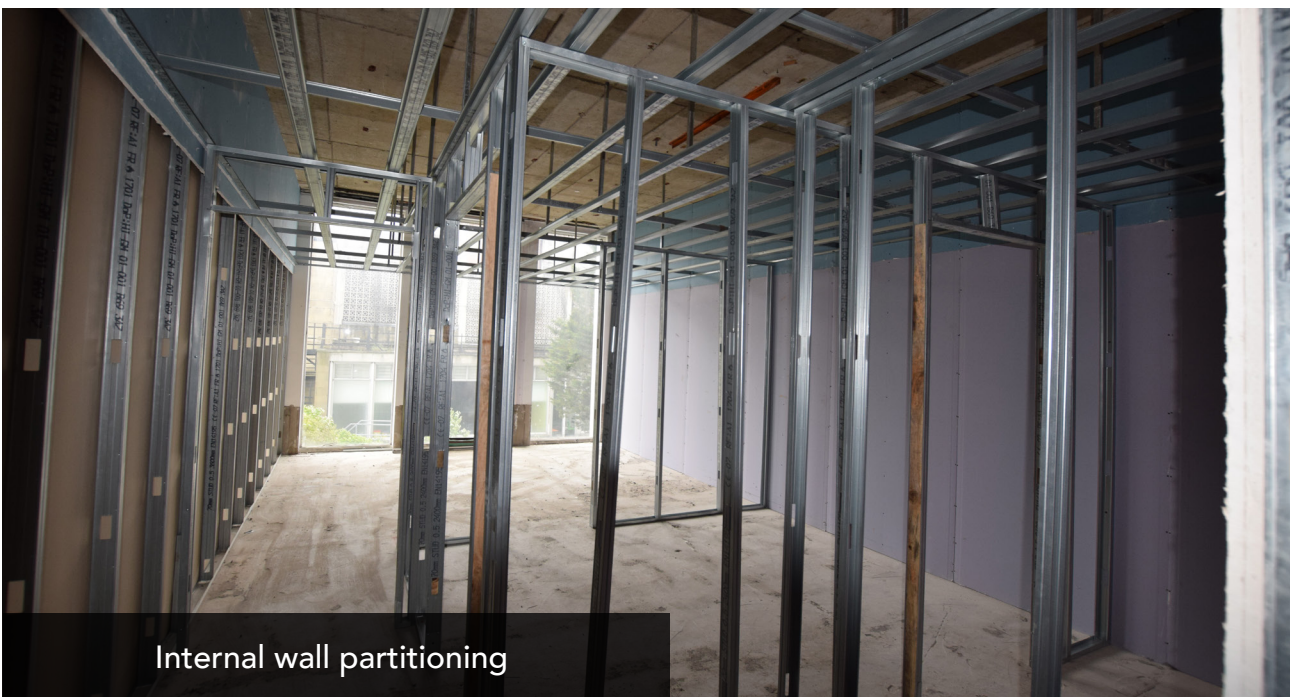
Internal wall partitioning