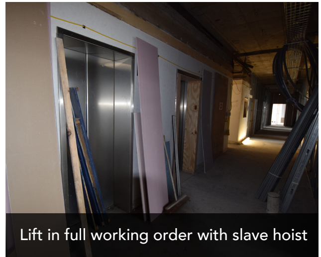
Lift in full working order with slave hoist