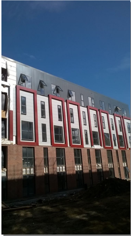
External façade of Block C