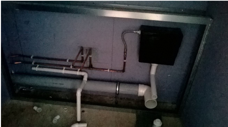
Block B sanitaryware installation