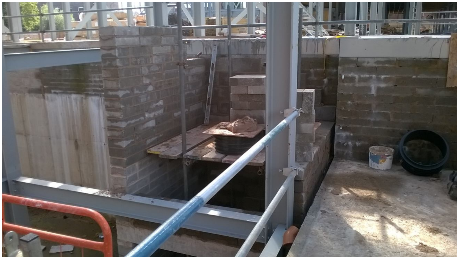
Block D lift shaft progressing