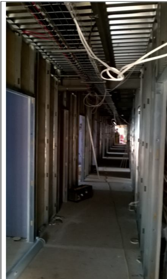
Block B upper floors level 4