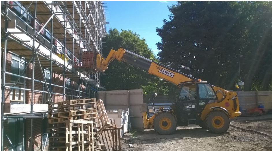
Block B External façade works progressing