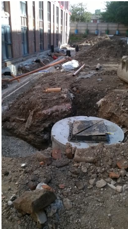
Courtyard drainage to Block C and E