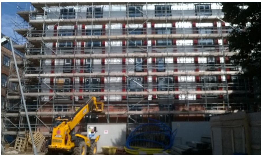
Block B external façade from Block D