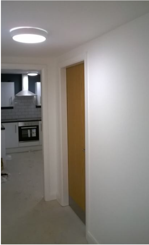
Block C Apartment corridor/kitchen