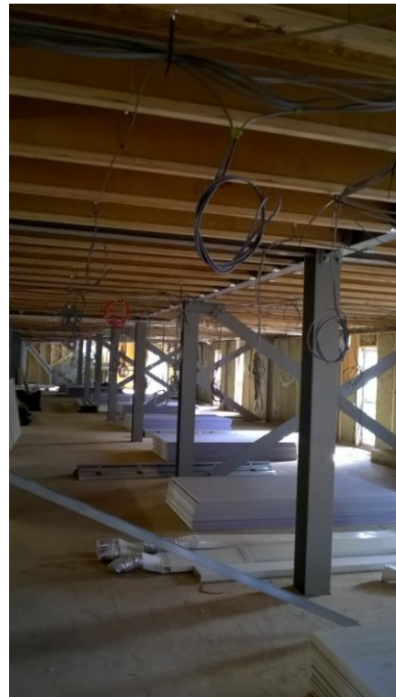
Block B Upper floors level 2