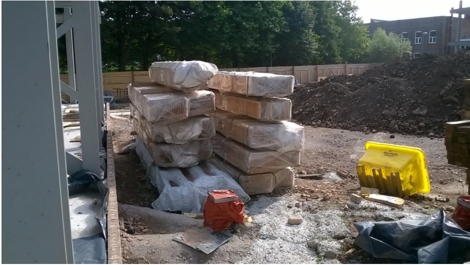
Block D materials delivery for upper floors