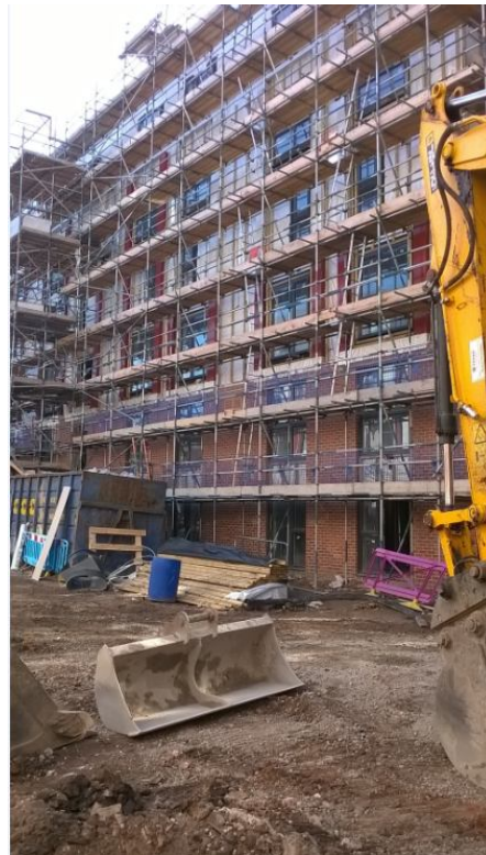
External façade to Block B from internal courtyard