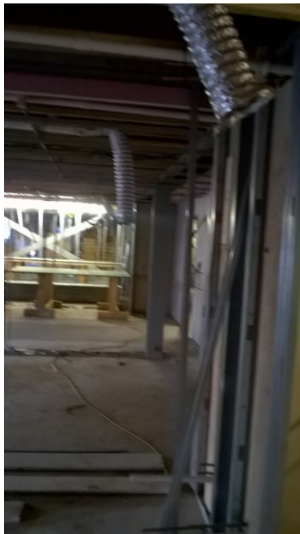
Block B upper floors level 3