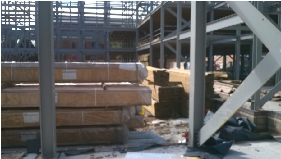
Block D materials delivery for upper floors