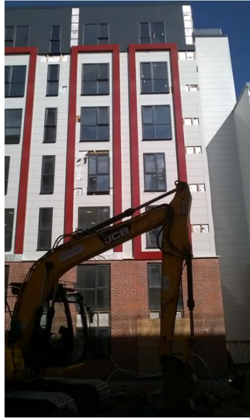
External façade of Block E