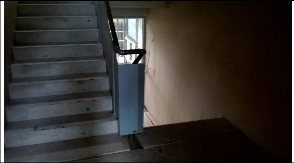
Block B – Escape Staircase