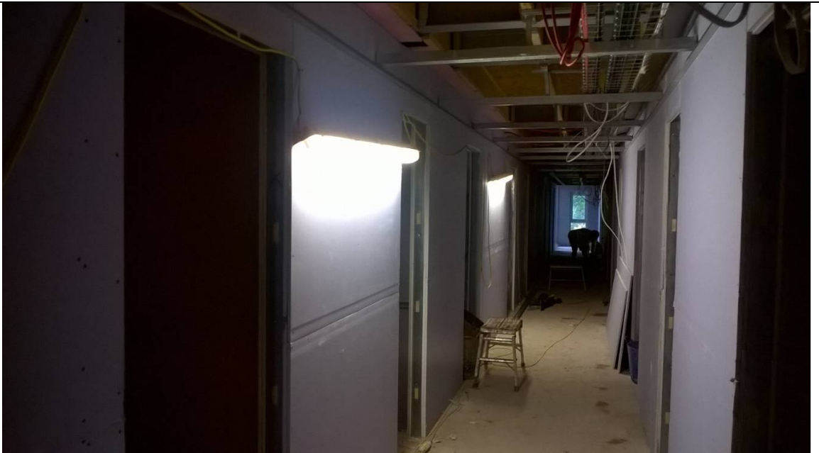
Block B – First floor corridor