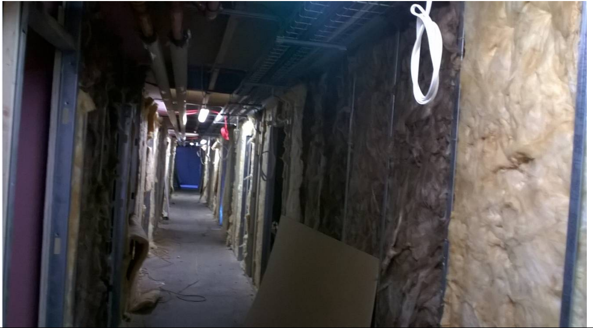
Block B – Ground floor corridor