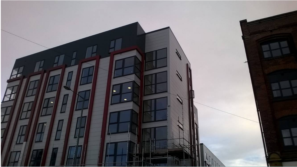
External façade of Block E