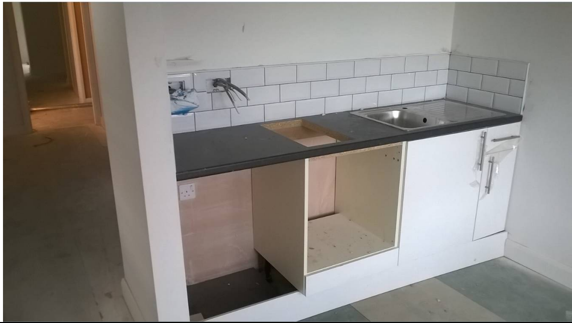
Block B – 6 th Floor apartment