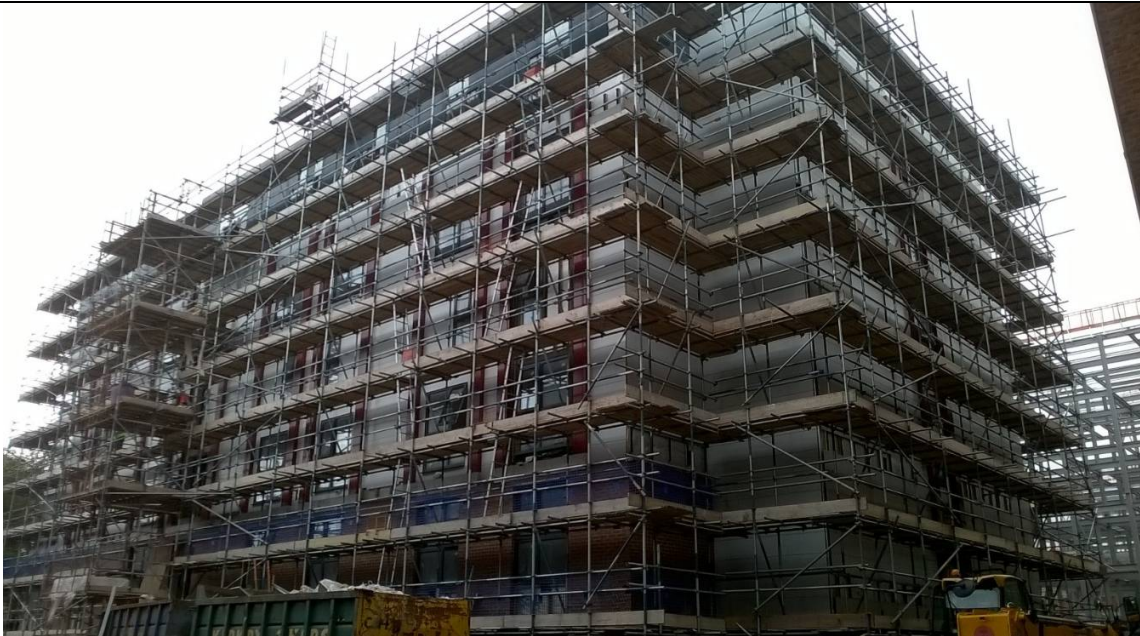
External façade of Block B