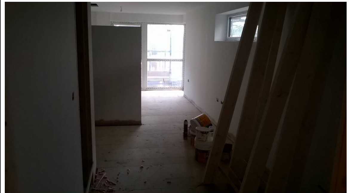
Block B – 5 th floor apartment