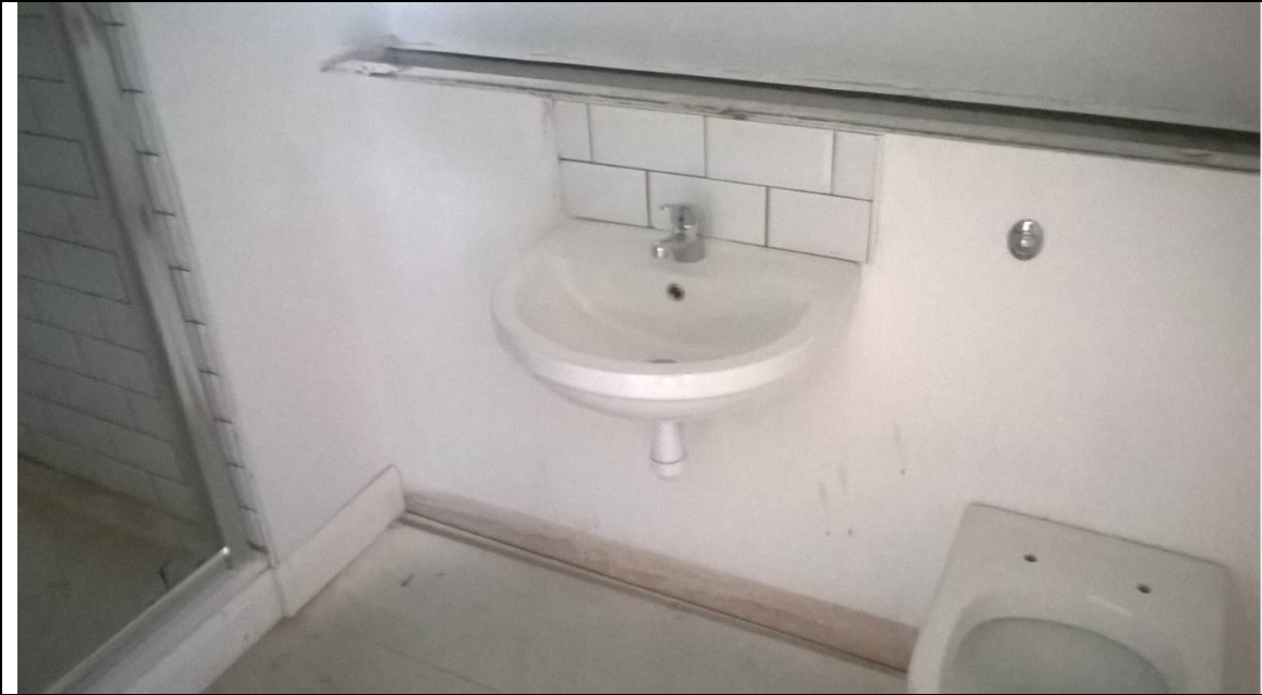
Block B – 6 th floor apartment